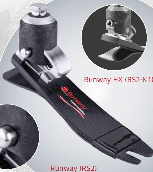
Runway HX (RS2-K1)